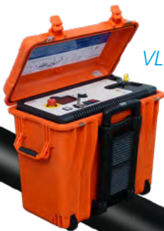
VLF SINE 34