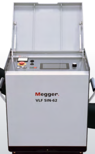
VLF SINE 62