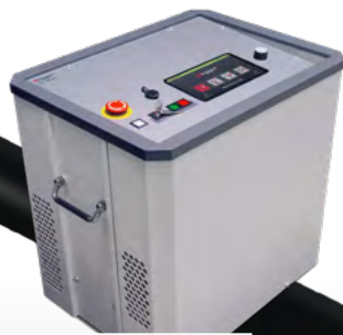
VLF SINE 45